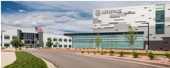
The new Colorado Springs facility digital engineering environment.

Our focus is on enterprise mission success, delivering integrated solutions and interoperability to meet the needs of a broader space ecosystem. We apply our expertise across mission lifecycles, ensure end-to-end integration of space systems, and align our efforts across national security, civil, and commercial space.